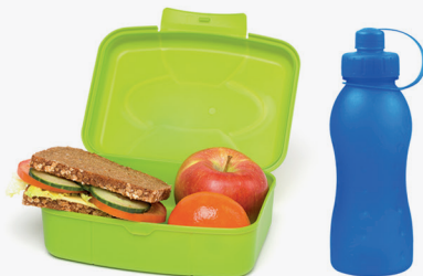
Lunch box and drinking bottle