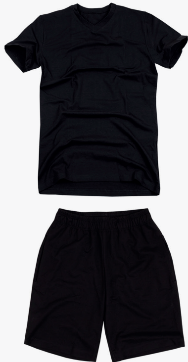
Sports clothing and shoes