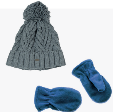
Cap and gloves