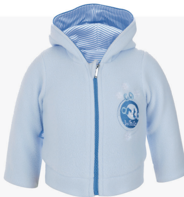
A thin fleece sweater