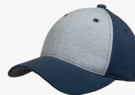
A sun hat or cap