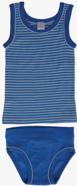
A set of underwear