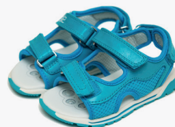
A pair of sandals or shoes