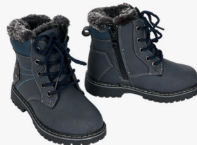
A snowsuit A pair of boots