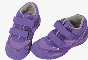
A pair of shoes

JANUARY / FEBRUARY / MARCH / APRIL / SEPTEMBER / OCTOBER / NOVEMBER / DECEMBER