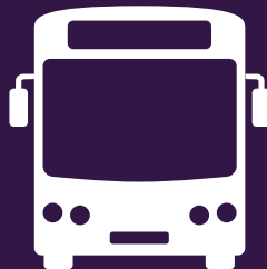
take the bus