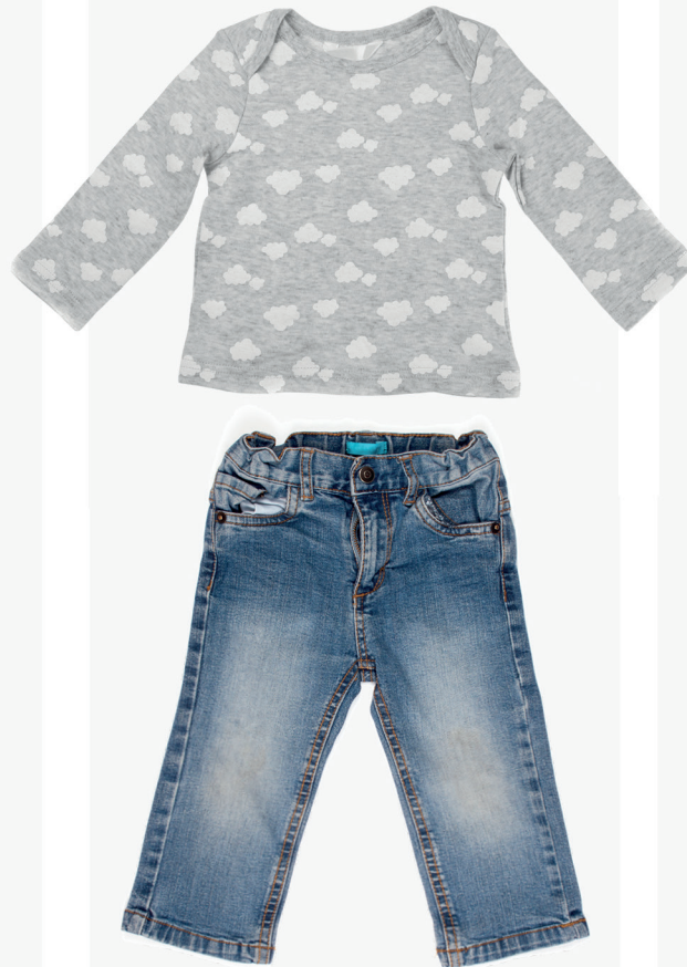
A change of clothes