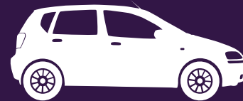
go by car

It is important that you accompany your child all the way into the kindergarten and greet the staff so they know that your child has arrived and is checked-in.