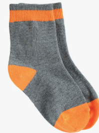
A pair of socks

Worth knowing You can save money by buying clothes in the secondhand shops.