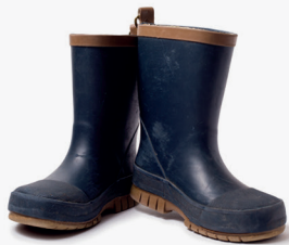
A waterproof suit A pair of rubber boots